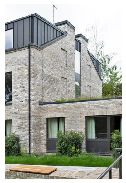
The St Regis development, showing the green roofs and cycle ranks, photovoltaic panels, and the CHP plantroom