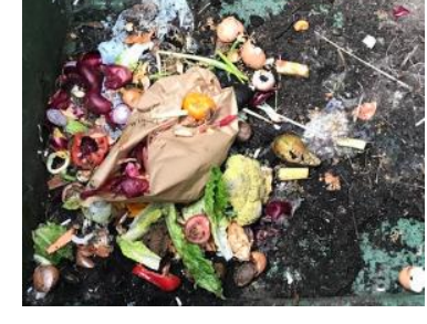
Food waste bin in use on Ashby Drive